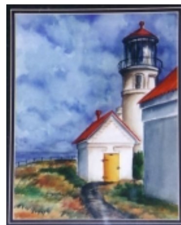
"Yellow Door" Heceta Lighthouse - An 18 x 22 Watercolor by Francine Derus Dark blue mat w/ dark blue frame - A premier raffle prize at this year's event.

The Communication and Education Committee is responsible for the Community Pot Luck, the Festival of the Lakes, and